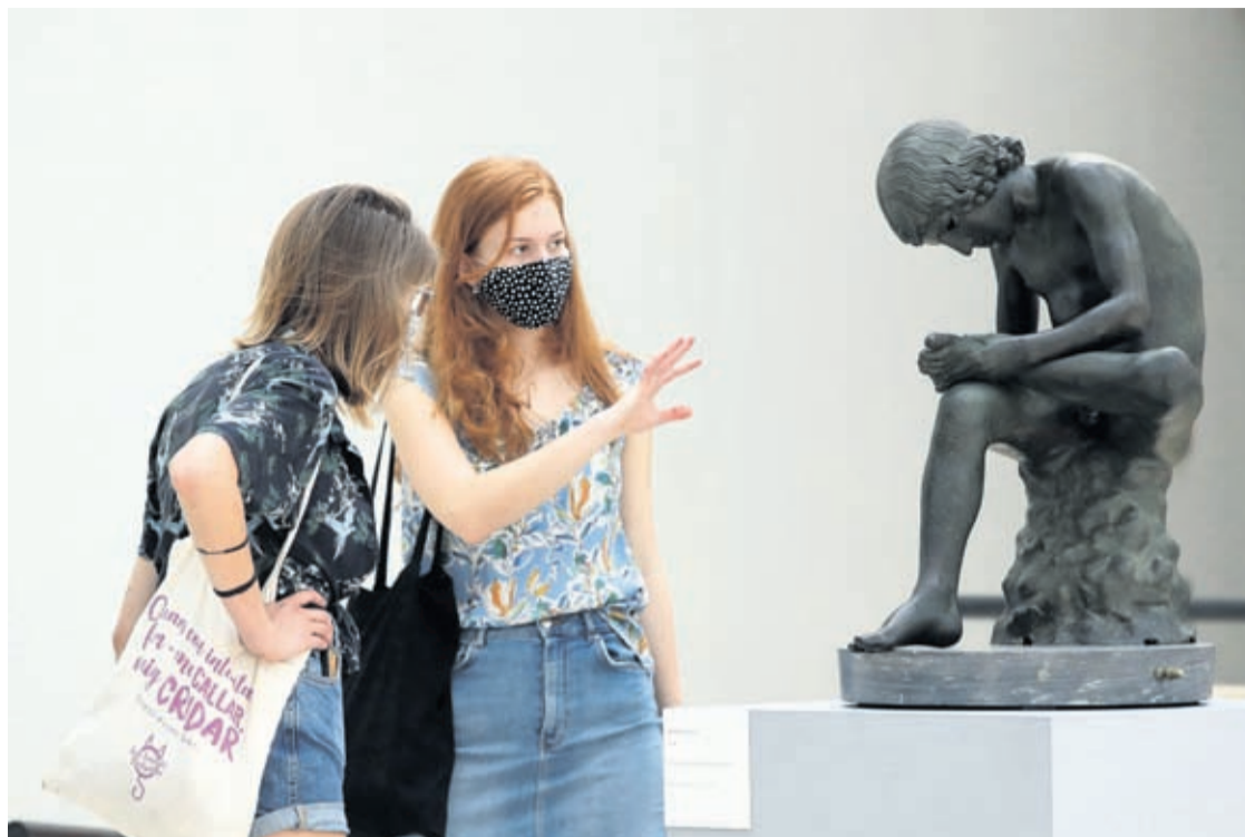
Visitors wearing face mask to prevent the spread of COVID-19, look at 'The Boy with Thorn' a first century B.C. bronze statue in the Rome's Capitoline Museums, Tuesday, May 19, 2020.

Some costly blockbuster shows have suffered heavy damage this spring. A once-in-a-lifetime exhibit bringing together fragile paintings by Flemish master Jan van Eyck had barely opened in Ghent, Belgium, when it was abruptly canceled. It won't be resumed,